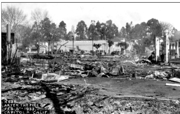
“After the Fire of Feb. 8th, 1933, Capitola, Calif.”

Santa Cruz Sentinel , March 7, 1942, p. 7.