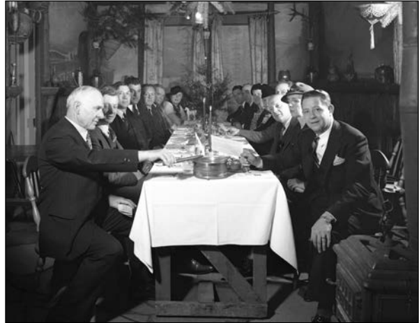
Mortgage burning, Santa Cruz Chamber of Commerce, December 14, 1936.