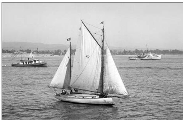
Sailboat on Monterey Bay, 1930s