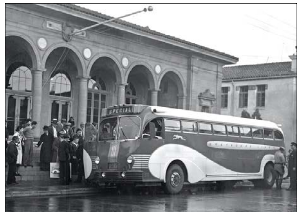
Christening of the Greyhound Bus "City of Santa Cruz," November 10, 1936.