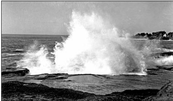
Big wave along West Cliff Drive, Santa Cruz, 1930s