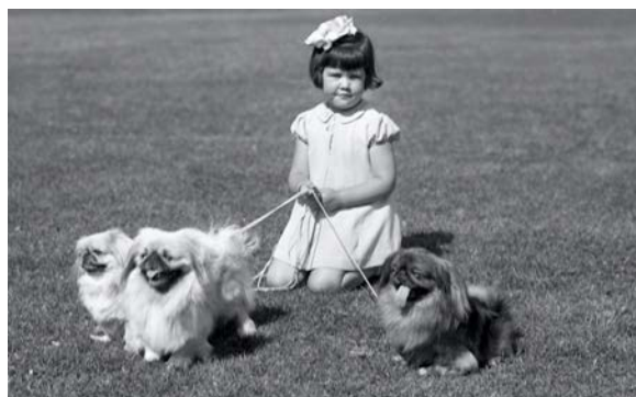
Santa Cruz Kennel Club 13th annual dog show, Santa Cruz High School athletic field, July 31, 1938.