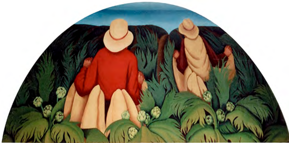
Artichoke Industry. Mounted in a lunette at the south end of the main lobby above the Postmaster's quarters. Oil on canvas; 36 x 72 inches.