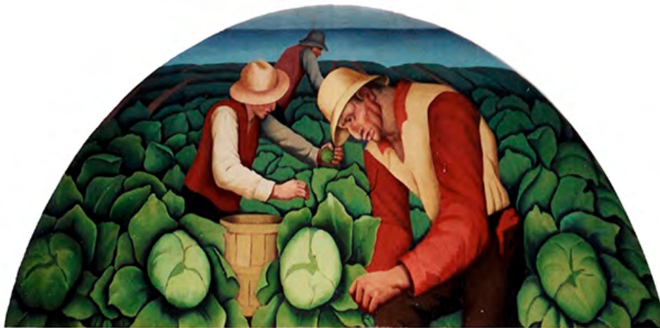
Brussels Sprouts Industry. Mounted in a lunette at the north end of the main lobby above what was the postal bank, opposite the Postmaster's quarters. Oil on canvas; 36 x 72 inches.

was to place art of the highest quality in federal buildings throughout the country. The Section was dedicated to commissioning mural artists based on the quality of their work, not their need.