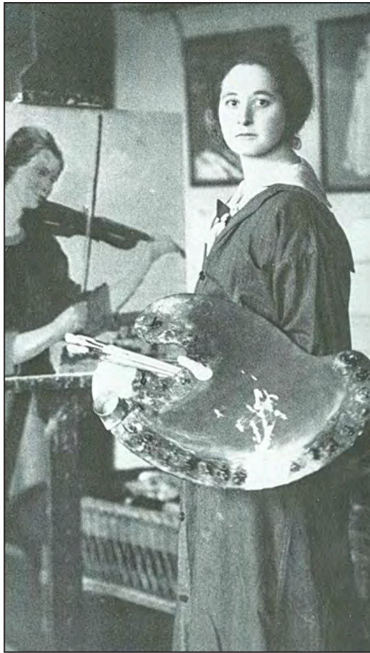
Henrietta Shore in her Los Angeles studio , c. 1915.

ers, shells, rocks, trees, mountains, hills—all have the same forms within themselves used with endless variety but with consummate knowledge....Rodin rightly said—a woman, a horse, a mountain—all the same thing. 27