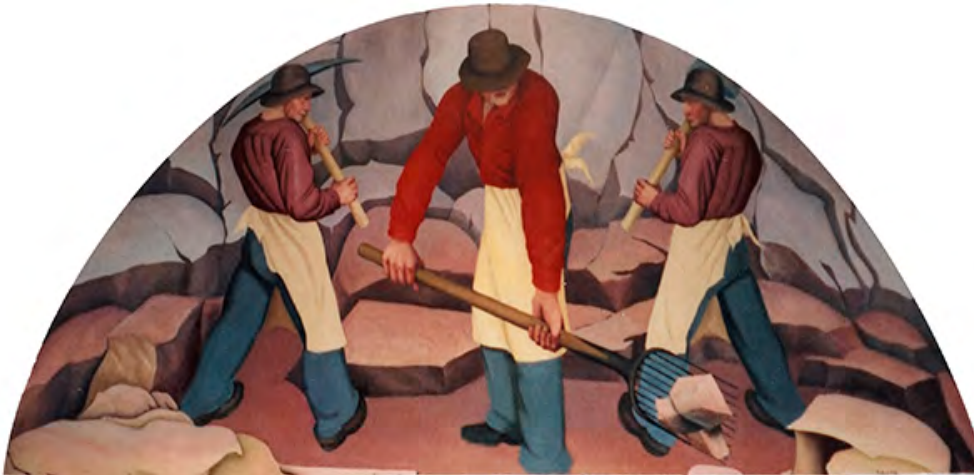
Limestone Quarries Industry. Mounted in a lunette at the north end of the lobby facing the main entrance. Oil on canvas; 48 by 102 inches.

theme; they speak of the dignity of labor and honor local industry.