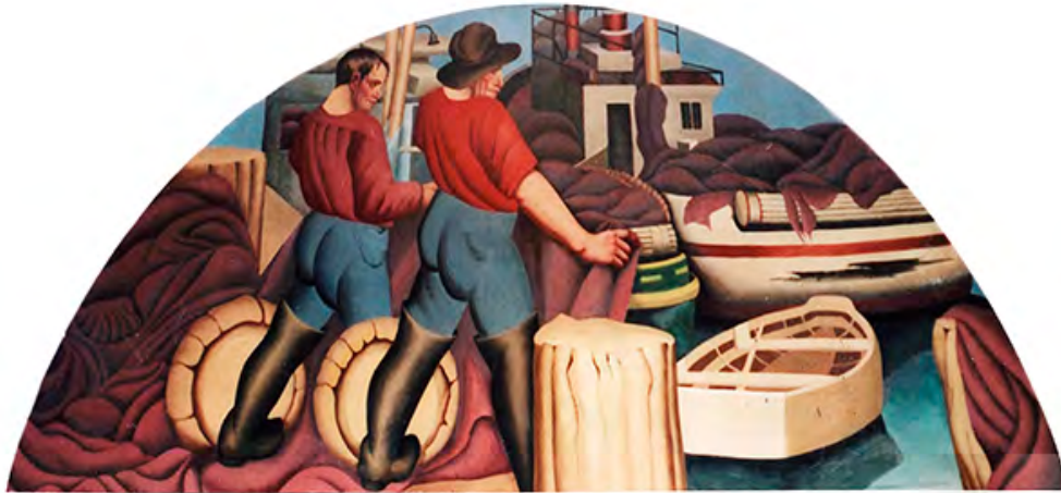
Fishing Industry. Mounted in a lunette at the south end of the lobby facing the main entrance. Oil on canvas; 48 by 102 inches.