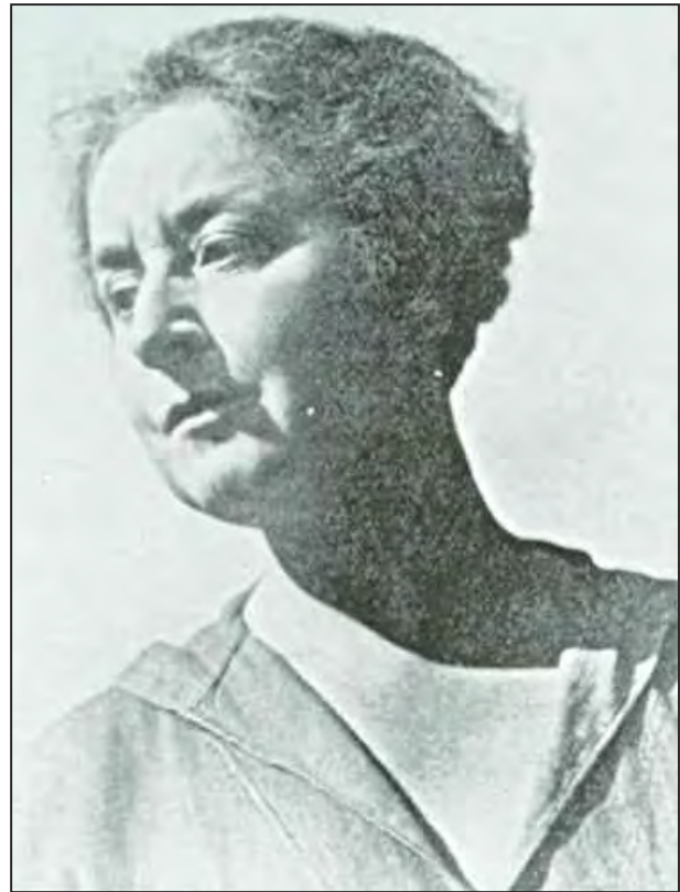
Henrietta Shore, 1927. (Photograph by Edward Weston, copyright 1981 Center for Creative Photography, Arizona Board of Regents)